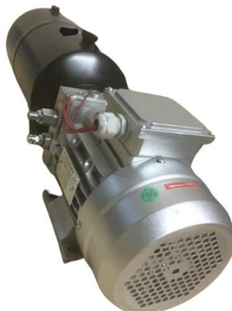
DC POWER PACK