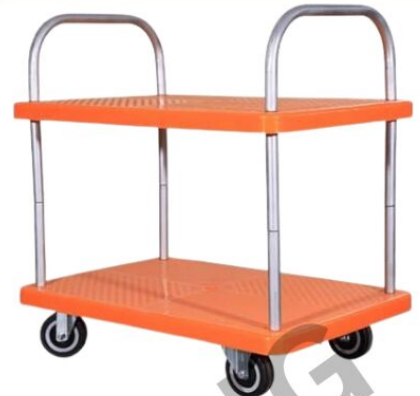
DOUBLE PLATFORM TROLLEY