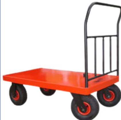
AIR WHEEL MS TROLLEY