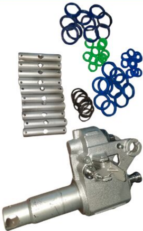
HPT PUMP SET