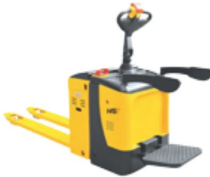
FULLY-ELECTRIC PALLET TRUCK