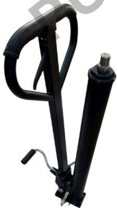
STACKER PUMP SET