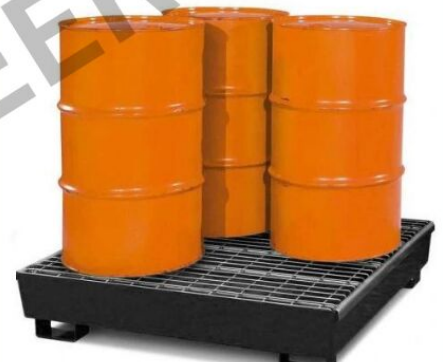
OILER PLASTIC PALLET