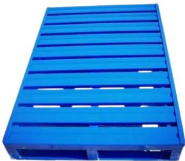
RACK/FLOOR PLASTIC PALLET