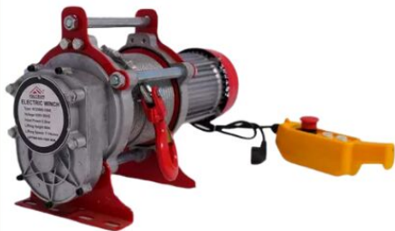
ELECTRIC WIRE HOIST