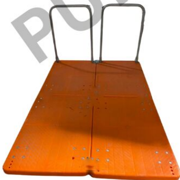
EXPANED PLATFORM TROLLEY