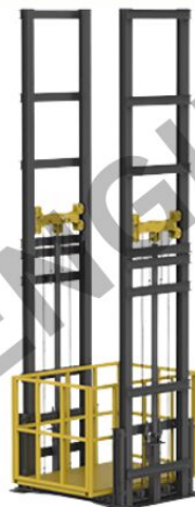
DOUBLE MAST LIFT