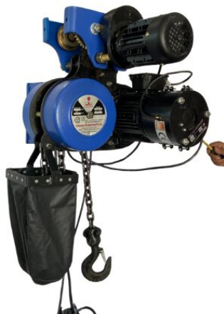
ELECTRIC CHAIN HOIST