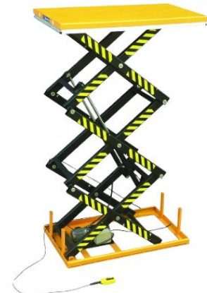
HIGH LIFT SCISSOR