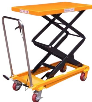
ELECTRIC SCISSOR LIFT