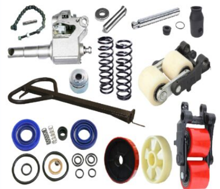
COMPLETE HPT KIT