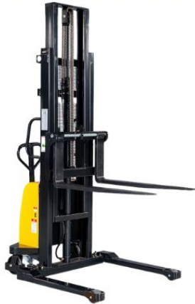
SEMI ELECTRIC STACKER