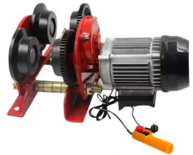
ELECTRIC TRAVEL TROLLEY