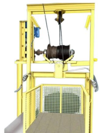
WIRE ROPE LIFT