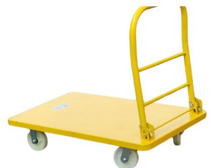
NYLON WHEEL MS TROLLEY