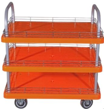
TRIPPLE PLATFORM TROLLEY