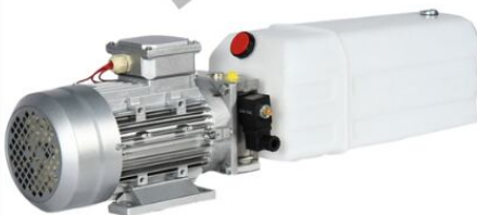
AC POWER PACK