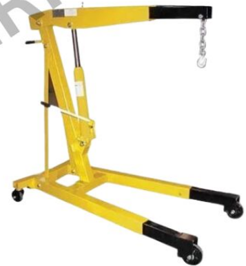
HYDRAULIC FLOOR BOOM CRANE