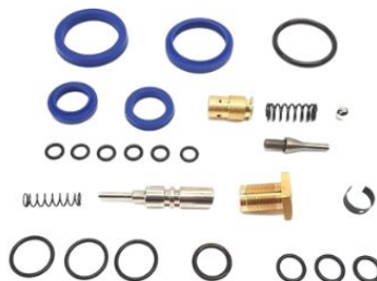
RELEASE CATRAGE VALVE