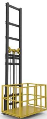
HYDRAULIC GOODS LIFT