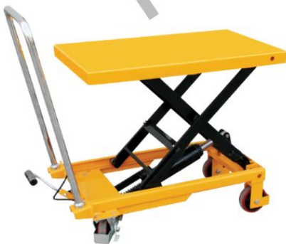
HYDRAULIC SCISSOR LIFT