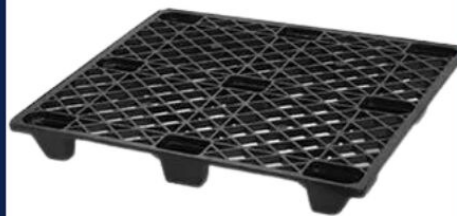
FLOOR PLASTIC PALLET