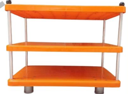
TRIPPLE PLATFORM RACK