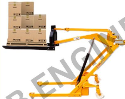
HYDRAULIC FLOOR CRANE