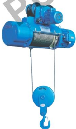
CD MODEL HOIST