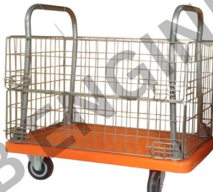
MESH BIN PLATFORM TROLLEY