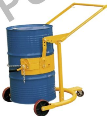
MANUAL DRUM L/T