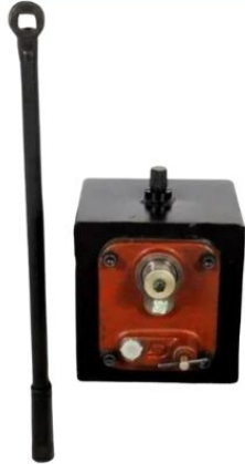
MANUAL HYDRAULIC PUMP