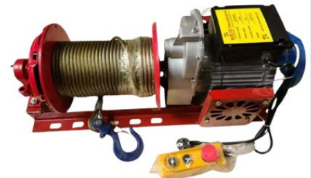
HEAVY DUTY WIRE HOIST