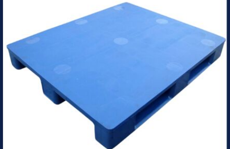
RACK PLASTIC PALLET