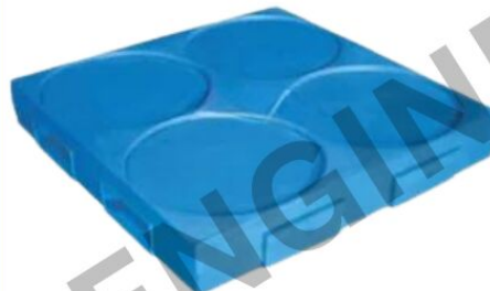
DRUM PLASTIC PALLET